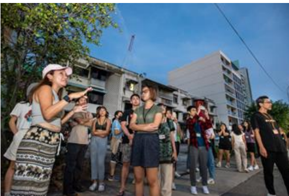
5. Participants on a walking tour around Geylang