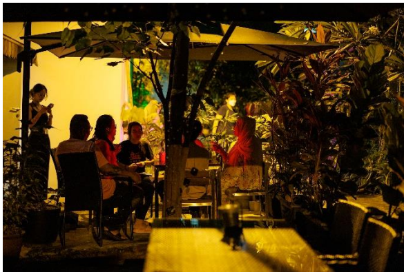
9. Late-night consultation with mentor and Judge Aidli Mosbit