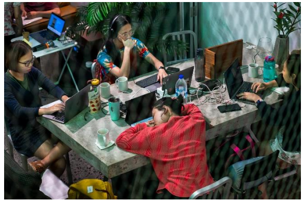
4. Participants working hard on their script #2