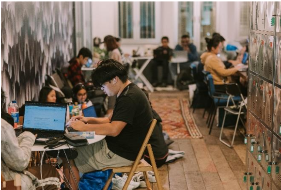
3. Participants working hard on their script #1