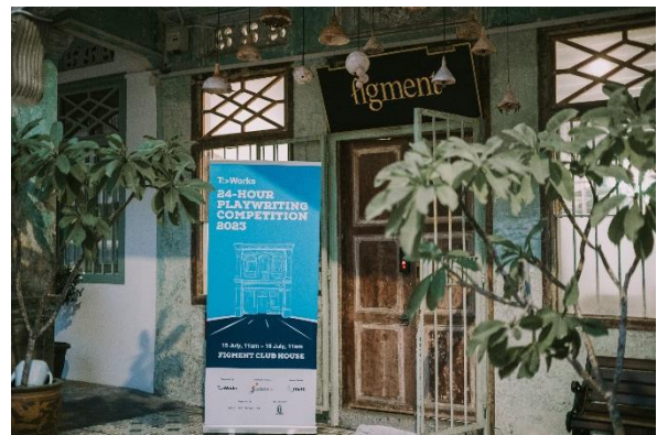
10. Banner of the 24-Hour Playwriting Competition outside Figment Club House

+++++